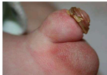
Picture 1: The penis after circumcision with the ring and string attached